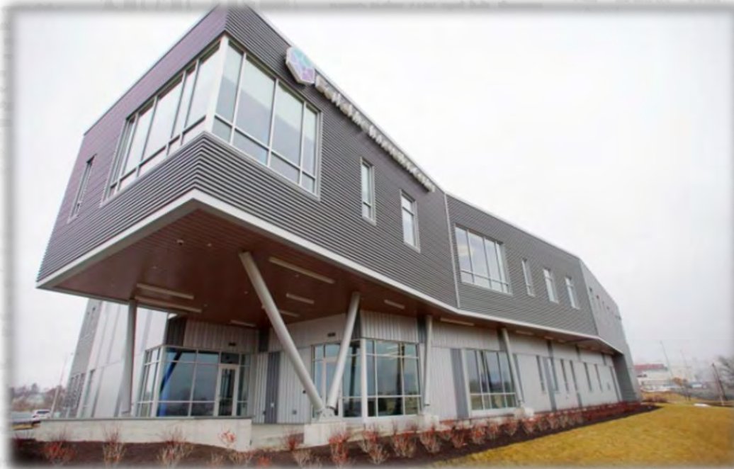
The Berkshire Innovation Center in Pittsfield, MA

The keynote focused on the work of the Mass. Manufacturing Emergency Response Team and the Commonwealth's manufacturing response to COVID-19.