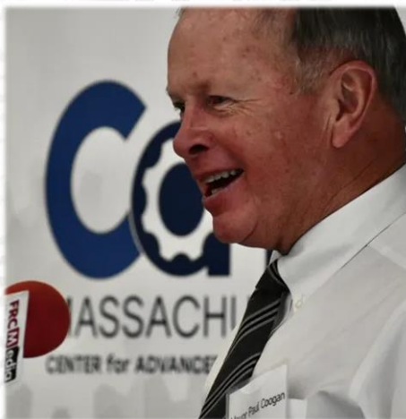
Fall River Mayor Paul Coogan