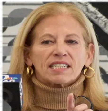
State Rep. Carole Fiola