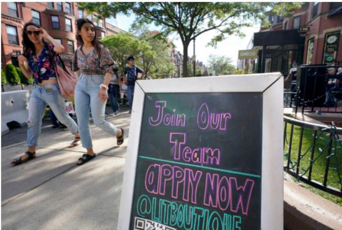
Pedestrians walk past a sign inviting people to apply for employment at a shop in Boston's Newbury Street.