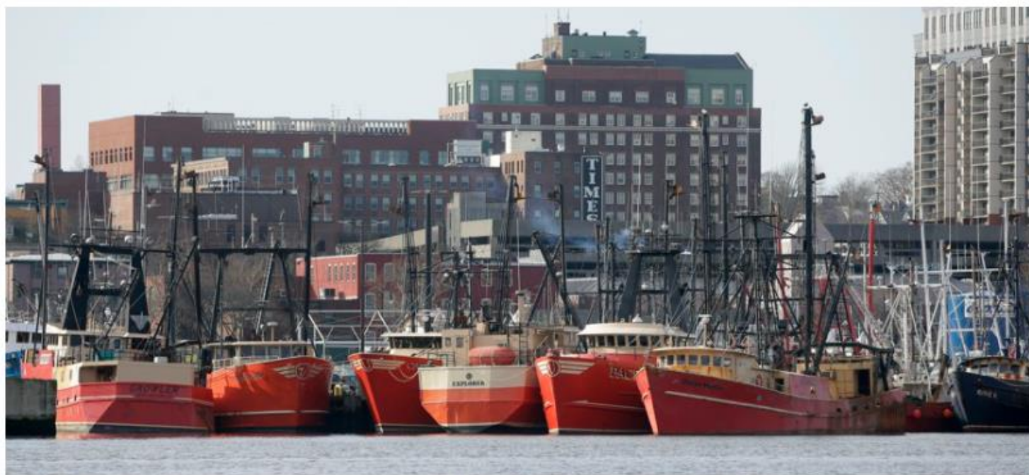
In this Wednesday, Dec. 6, 2017 photo fishing vessels are docked in New Bedford Harbor, in New Bedford, Mass.