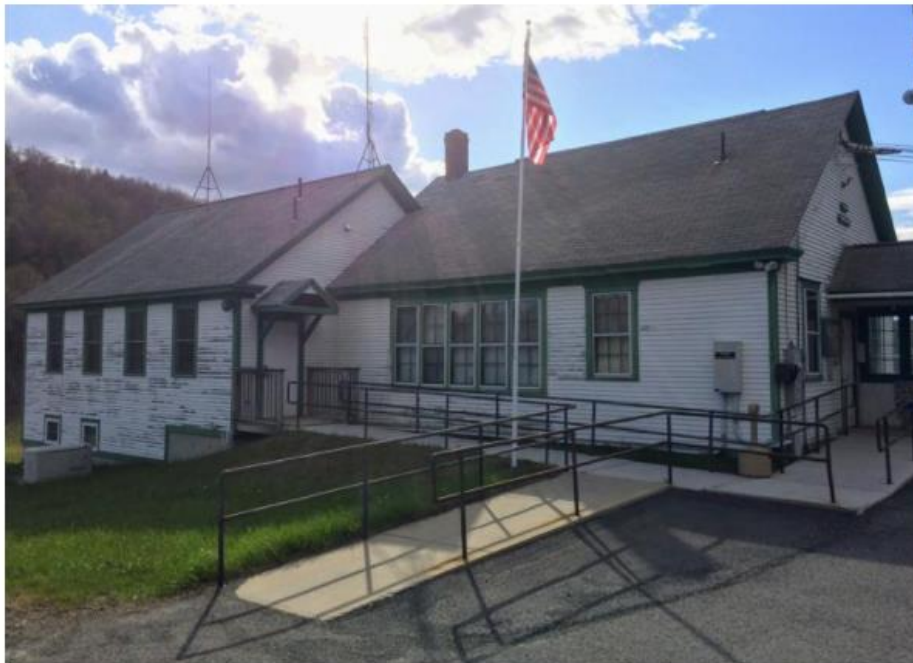
A high-speed wifi hotspot will continue to operate at Savoy Town Hall and in three other locations in the Berkshires. The state this week extended the program, created in April 2020 to help families without broadband at home.

The Essex County Community Foundation (ECCF) published a column in the Salem News that highlights how a grant from the MBI has enabled internet access for 20 low-income families across the North Shore, including assistance with a connection, computers, and digital literacy training.