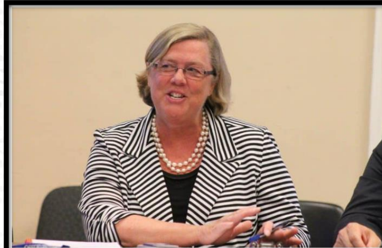
Executive Director of MassTech on creating spaces for innovation and inclusion in S.T.E.M.

THE ONLINE NEWS SOURCE OF MASSACHUSETTS' LATINOS